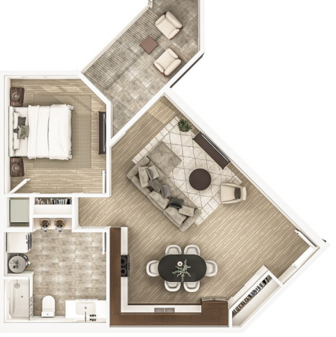
POPPY-807 sq. ft.