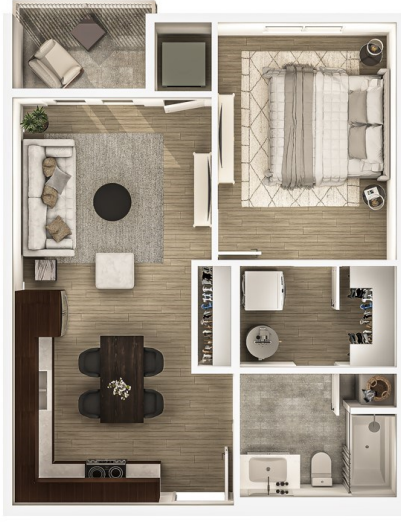
ORCHID-654 sq. ft.

An Orchid Suite will be available as a show room early October. Please see Tanis to schedule a showing. The remainder of the building (including other suites) is expected to open January 2025. A general showing for all residents will be scheduled at a later date.