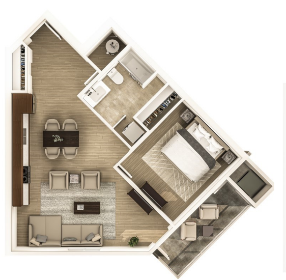
CARNATION-864 sq. ft.