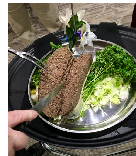
Cutting the haggis