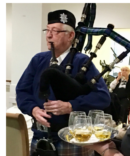
Don piping in the haggis